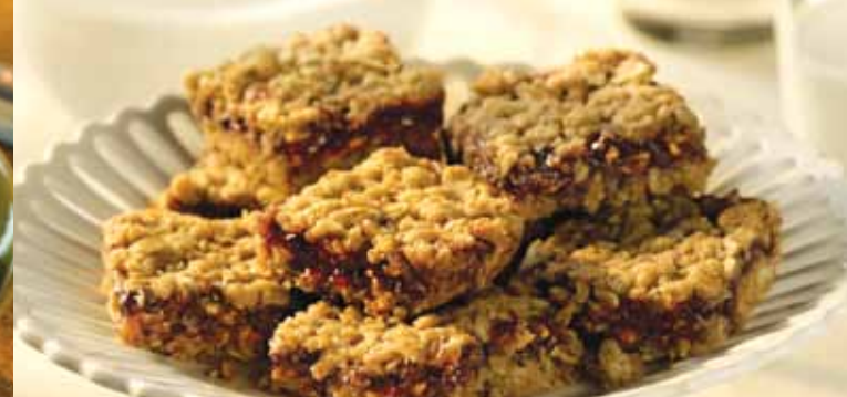
from the kitchen of | Tracy Noerper, Nashville, TN