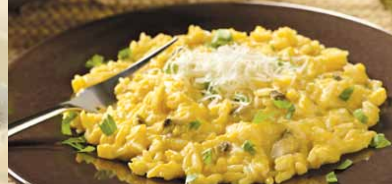
from the kitchen of | Nancy Castellana, Stamford, CT